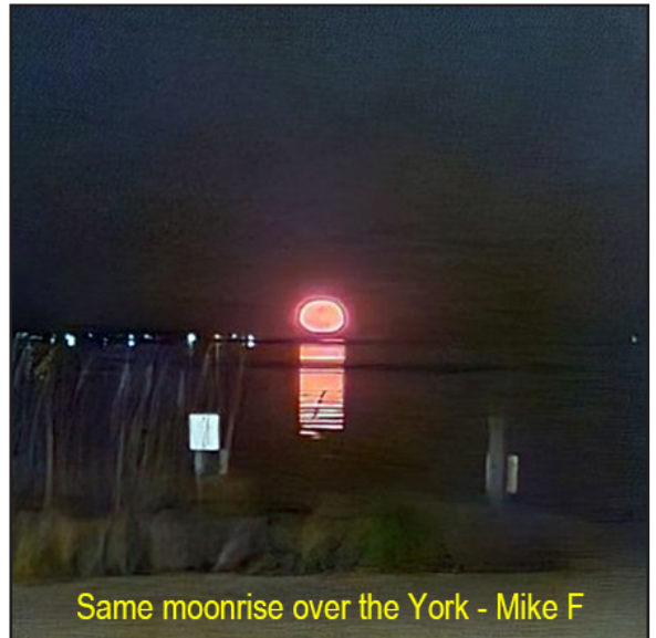
Same moonrise over the York