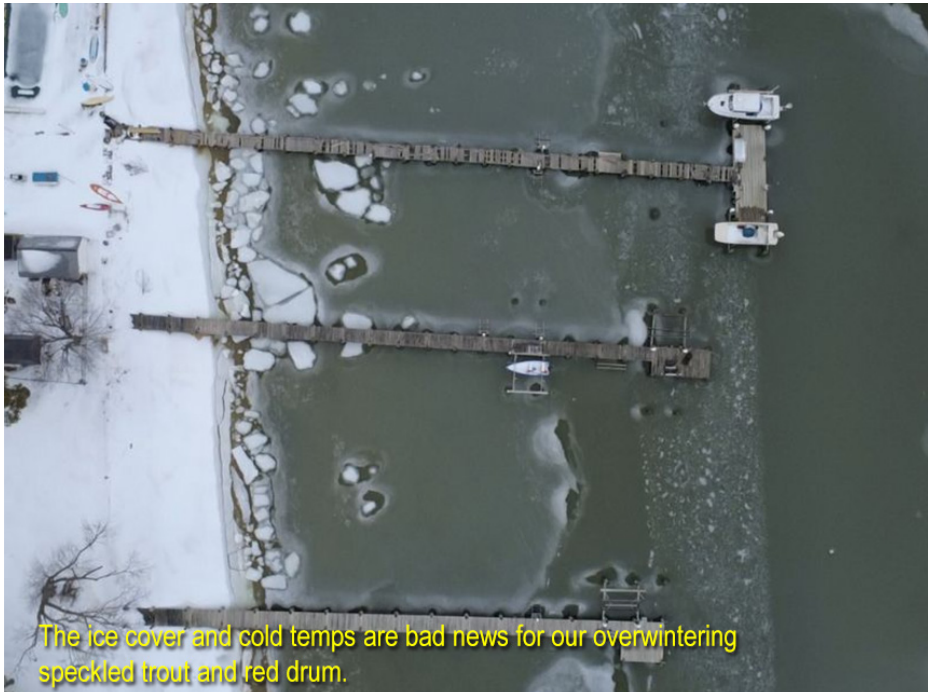
The ice cover and cold temps are bad news for our overwintering speckled trout and red drum.