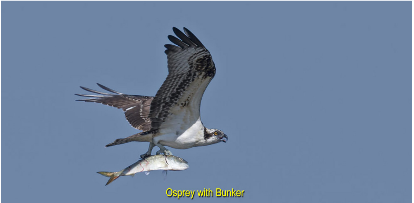
Osprey with Bunker