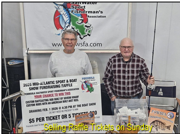
Selling Raffle Tickets on Sunday