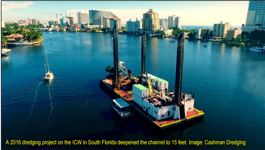
A 2016 dredging project on the ICW in South Florida deepened the channel to 15 feet.

If you're a cruiser who has put in a lot of engine hours on the Chesapeake Bay, the Intracoastal Waterway (ICW) is a tempting next step. With the mouth of the Bay as its jumping off point, the 1,100-mile ICW offers adventure and a ticket to the southern locales that can extend your boating season right into winter.