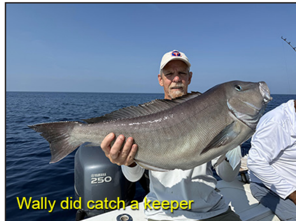
Wally did catch a keeper