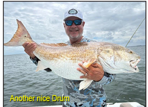
Another nice Drum