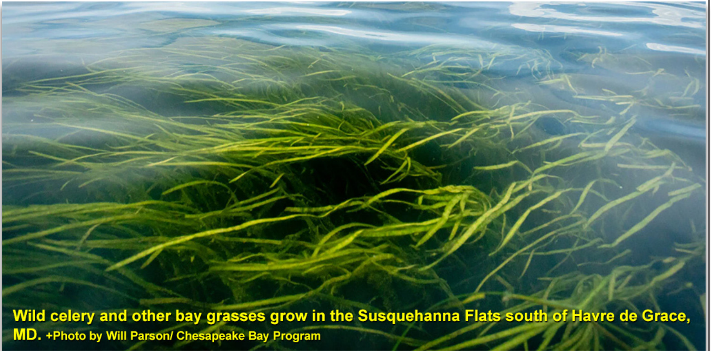
Wild celery and other bay grasses grow in the Susquehanna Flats south of Havre de Grace, MD.