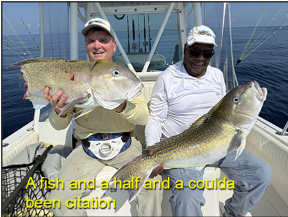
A fish and a half and a coulda been citation