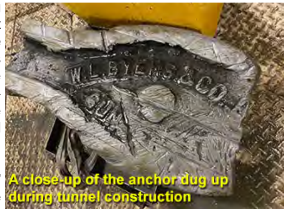
A close-up of the anchor dug up during tunnel construction