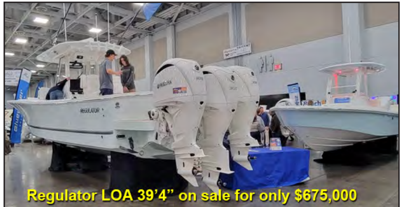
Regulator LOA 39'4" on sale for only $675,000