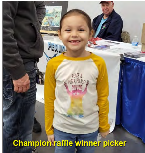
Champion raffle winner picker