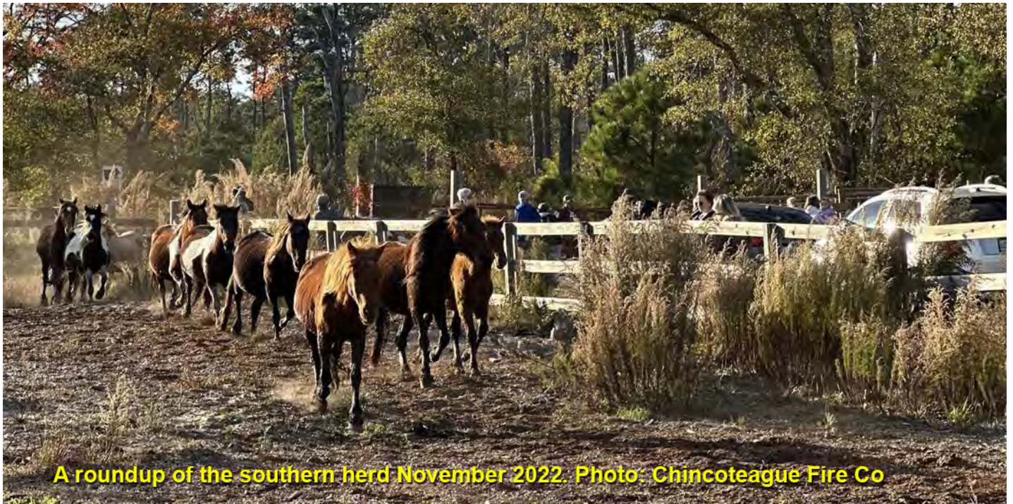
A roundup of the southern herd November 2022.

Update: the bill to make the Chincoteague pony Virginia's state pony has made it to the governor's desk and is waiting to be signed into law.