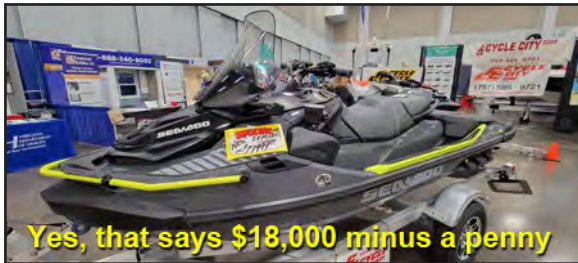
Yes, that says $18,000 minus a penny