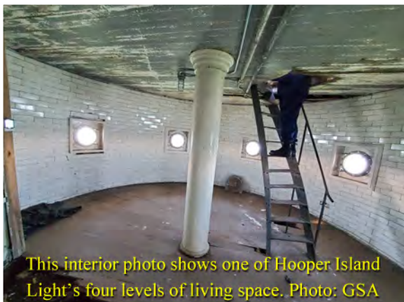
This interior photo shows one of Hooper Island Light's four levels of living space.

There is some fine print to the purchase of the lighthouse. The buyer gets the structure, but the underlying submerged land does not convey in the sale—it remains with the U.S. government per a cession deed from 1924.