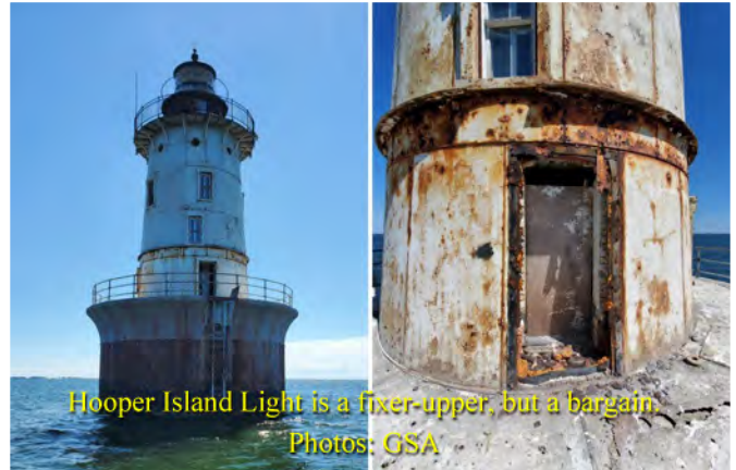
Hooper Island Light is a fixer-upper, but a bargain.

The lighthouse, first lit in 1902, is the only cast-iron caisson lighthouse in Maryland with a watch room and lantern surmounted on the tower, according to the U.S. Lighthouse Society (USLHS) Chesapeake Chapter. It is exactly halfway down the Chesapeake Bay.