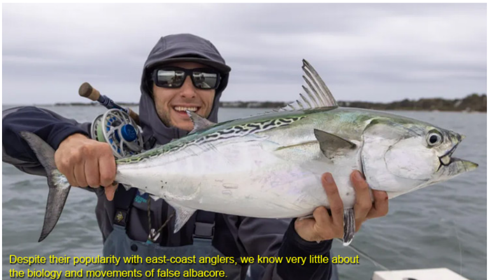
Despite their popularity with east-coast anglers, we know very little about the biology and movements of false albacore.

To help answer these questions, we’re thrilled to be partnering with the Anderson Cabot Center for Ocean Life at the New England Aquarium on a pilot study to acoustically tag 50