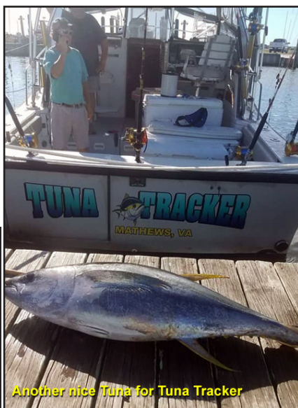
Another nice Tuna for Tuna Tracker