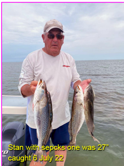
Stan with sepcks one was 27" caught 6 July 22

We're beyond excited to get this work underway and start gathering some key baseline information on this highly valued but poorly understood species. Stay tuned for updates later this year as we begin our field work and hopefully start collecting results!