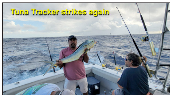
Tuna Tracker strikes again