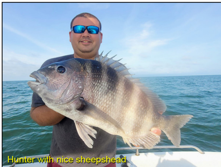
Hunter with nice sheephead