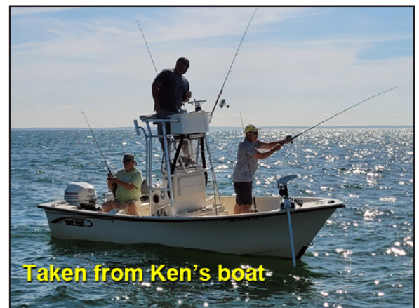
Taken from Ken's boat