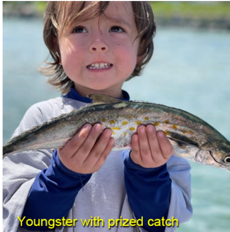
Youngster with prized catch

Schools of red drum are popping up near the third and fourth islands. If you can't find fish to sight cast try anchoring and chumming near shoals.