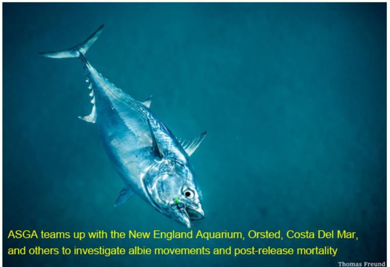
ASGA teams up with the New England Aquarium, Orsted, Costa Del Mar, and others to investigate albie movements and post-release mortality

For fly and light-tackle anglers along the U.S. east coast, few species attract more of a cult following than the false albacore, endearingly referred to as “albies” (and formally known as little tunny, Euthynnus alletteratus ). Fast-moving, difficult to fool, and brutally hard-fighting, they have been described by anglers from Cape Cod to Cape Lookout as “the perfect sportfish,” and according to NOAA Fisheries they’re the primary target of about a half-million trips annually along the Atlantic coast. Even further south, where so-called “bonita” (a misnomer, by the way) have historically been looked down upon as a trash fish only good for bait, they’ve begun to earn respect in areas such as Florida’s Treasure Coast. Their increasingly wide acclaim, in spite of generally being viewed as less-than-stellar table fare, makes albies a prime example of a species whose value to the recreational fishing economy stems from its abundance.