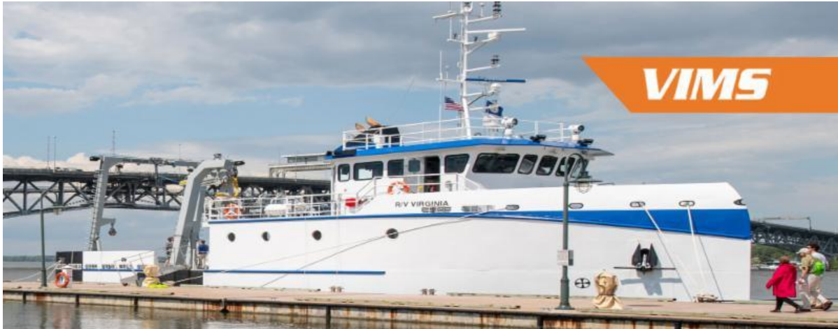
The R/V Virginia will be open to the public in Alexandria, Virginia, this month.